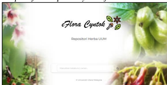
(a) Search facility