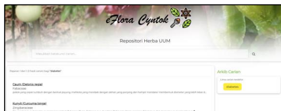
(b) Search results